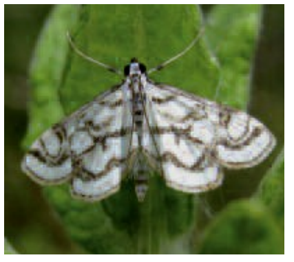
China Mark

flying groups such as the colourful little moths in the genus Pyrausta and the China-marks which can be found in wet areas. In addition to books you will probably need a digital camera with a good closeup macro mode, a fine-mesh net. some specimen tubes and a small magnifying lens (x10). Catching and keeping specimens identification (even if you later release them) is necessary for many micros and a few of the macros. Wing markings may be sufficient but you can't carry all the necessary books in a rucksack! Of course, don't collect specimens at a site unless you have permission to few people search do so. So specialised habitats for micromoths that there could be a lot of scope for finding species that are new to your area, or which haven't been recorded for several decades You don't need to be an expert to find such species, you just need to spend time out in the countryside.