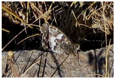
Madeira Grayling

At the highest levels above the clouds at places like Paul da Sierra and Pico do Arieiro there were scores of Graylings and many other "browns"; unfortunately as I was on an organised tour, the minibus did not stop in the places where the most butterflies flew