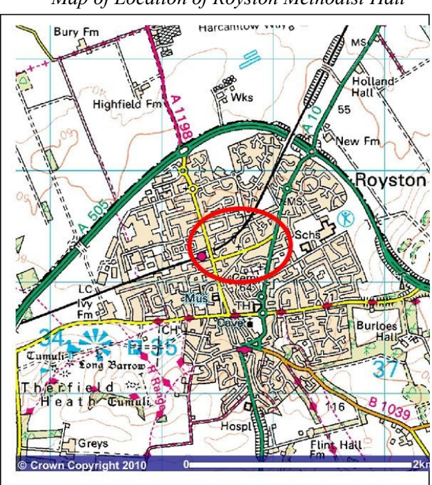
Map of Location of Royston Methodist Hall

Queens Road is a one-way street and quite narrow. From the A10 turn into Mill Road which will lead to Queens Road - the entrance to Mill Road is also quite small – please follow the map for directions! There is on street parking - ideally park just before the hall in Victoria Crescent.