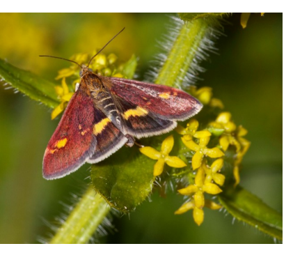
Pyrausta aurata

Reading up on species you've not seen can pay dividends, but about half of my finds are by chance, including some UK rarities. Anyone can make such finds, but you will only know you have a "good record" if you are able to identify the specimen or if someone else, such as the County Moth Recorder, is able to do this for you. Most moth-ers tend to think of their hobby as a primarily nocturnal one, but get out there in the sunshine and you'll be amazed at what you can find