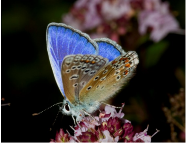
Common Blue

food plant and nectar source. Given that a haylage crop will be taken in mid -June, these conditions can best be met, in respect of Bottom Field, by continuing the present cutting programme, whereby a proportion of the meadow is left uncut each year. A June cut will undoubtedly reduce the potential numbers of 2<sup>nd</sup> brood common blues reaching maturity. However, the earlier 2<sup>nd</sup> flowering of